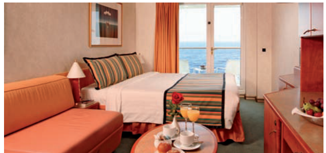
Cabin with ocean view balcony