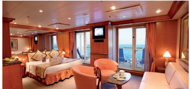
Grand Suite with ocean view balcony